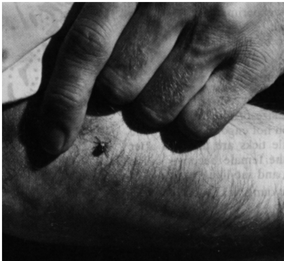
Figure 2. The female Dermacentor andersoni is smaller than a fingernail.