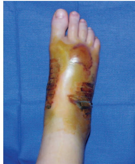
Figure 2B. Two-week postoperative view.