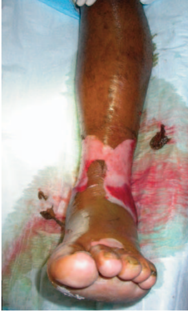
Figure 3B. Operating room presentation with fluid-filled fracture blisters associated with an ankle pilon fracture.