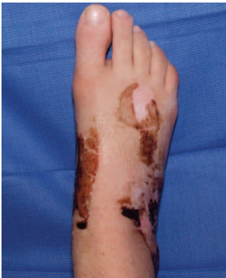
Figure 2C. Six-week postoperative fluid-filled fracture blister following elective reconstructive rearfoot surgery.