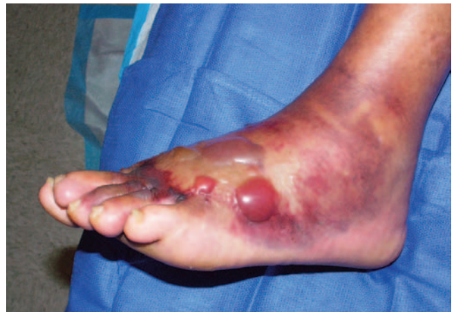
Figure 4C. Combination fluid and blood-filled fracture blisters on the same patient with a wide distribution of fracture blisters even to the digits with trauma to the midfoot.

blister comprises the entire epidermis and the base is the dermis. In blood-filled fracture blisters, the vasculature of the papillary dermis is damaged allowing bleeding into the blister cavity. These blisters represent a more significant injury to the skin both histologically and clinically. The entire epidermis over the blister site becomes necrotic. Blood-filled fracture blisters can heal with dermal scarring and pigmentation changes to the skin. Later evidence of scarring or pigmentation changes to the skin may be used to clinically determine the former presence of a blood-filled