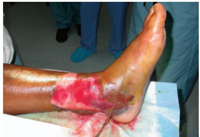
Figure 6. Ruptured fluid-filled fracture blister.

In a study by Varela et al, few patients with fracture blisters demonstrated sufficient signs and symptoms of compartment syndrome to warrant suspicion of undue elevation of the interstitial pressure in the soft tissues overlying the fractures, even with a high index of suspicion. 2 This is thought to be due not only to the relative absence of pressure-sensitive muscle in fracture blister prone sites reducing the incidence of symptoms, but the ability of pressure in these areas to dissipate along skin-fascial planes by the formation of fracture blisters. This is demonstrated clinically by calcaneal fractures where fracture blisters may form not just in the foot, but more proximally over the lower leg as well (Figure 4C). Areas of bony prominence with little natural soft tissue between the skin and bone are the most prone to fracture blister formation such as the ankle, elbow, and knee.