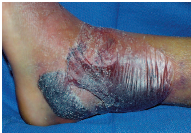
Figure 1. Blood-filled fracture blister associated with a closed bimalleolar ankle fracture.

If all fractures are considered, there is a 2.9% incidence of fracture blister formation. When comparing only those injuries prone to form fracture blisters, the incidence rises to 5.2%. They can rarely but occasionally be noted after non-traumatic elective reconstructive foot and ankle surgery. Fracture blisters are typically located distal to the mid-shaft of the humerus in the upper extremity and distal to the knee in the lower extremity. Conclusions based on the presence of