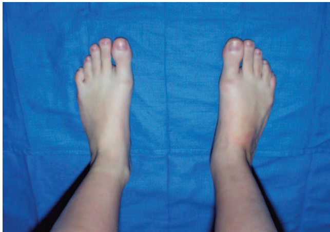
Figure 2A. Preoperative view.