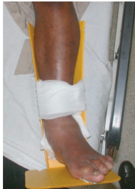
Figure 3A. Emergency room presentation without fracture blisters.

fracture blisters are inconclusive in terms of the severity of the injury, timing of the injury, or the appropriateness of treatment or patient compliance as well as the health history of the patient.