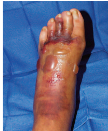
Figure 4A. Fluid-filled fracture blister.