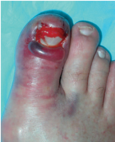
Figure 4B. Blood-filled fracture blister.