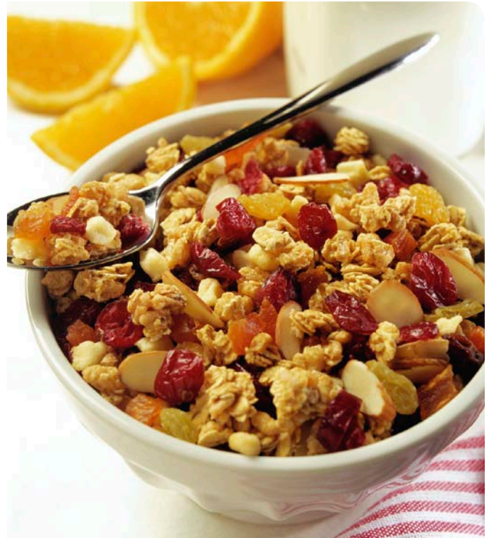
You can help improve your cholesterol by eating foods that are lower in saturated and trans fats.