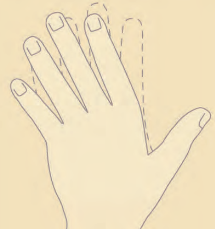
Figure 2: Drift of the fingers away from the thumb